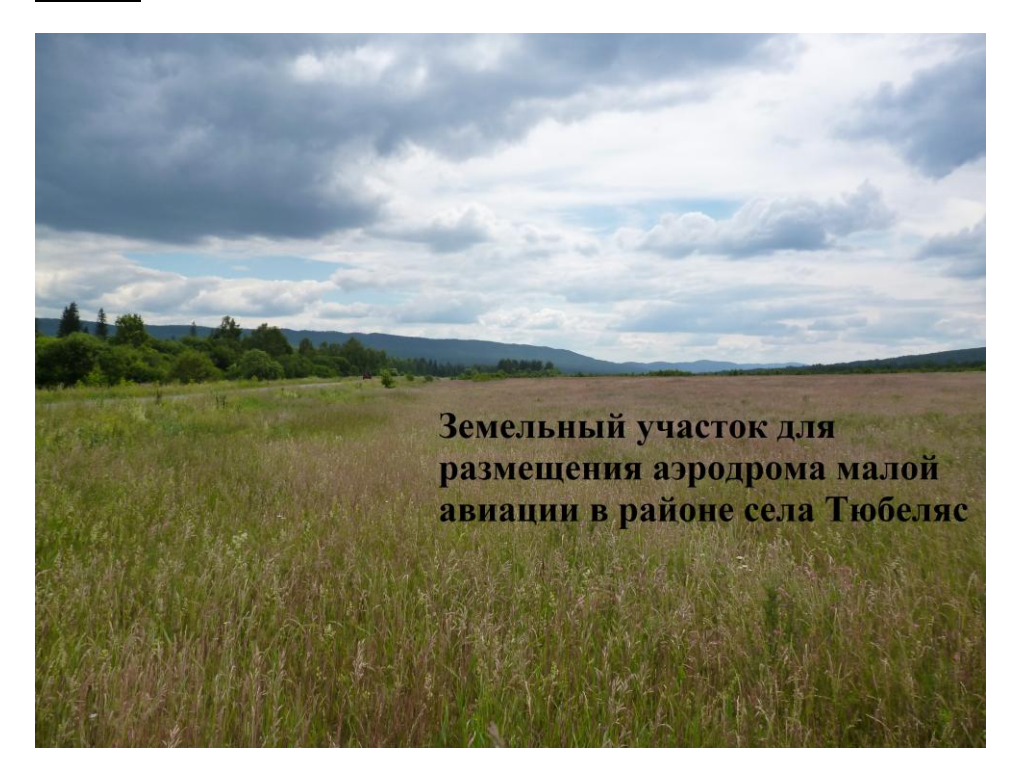
Plot of Land for Construction of a Light Aviation Aerodrome near Tyubelyas